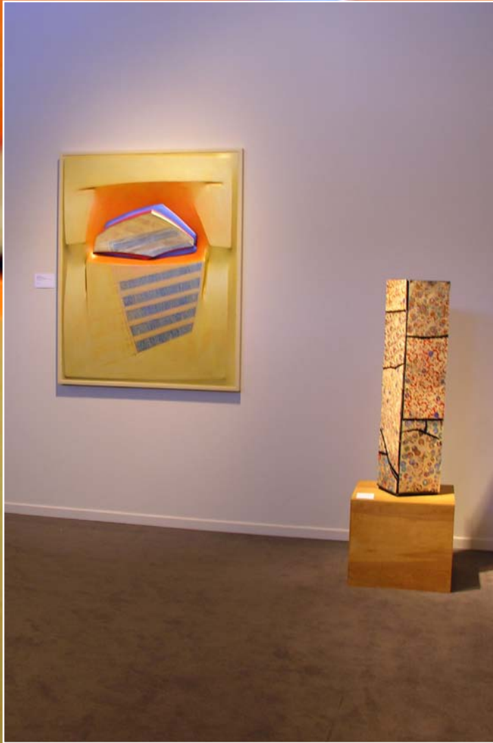
Installation View of 2009 Juried All Media Exhibition

Palos Verdes Art Center Exhibitor Prospectus