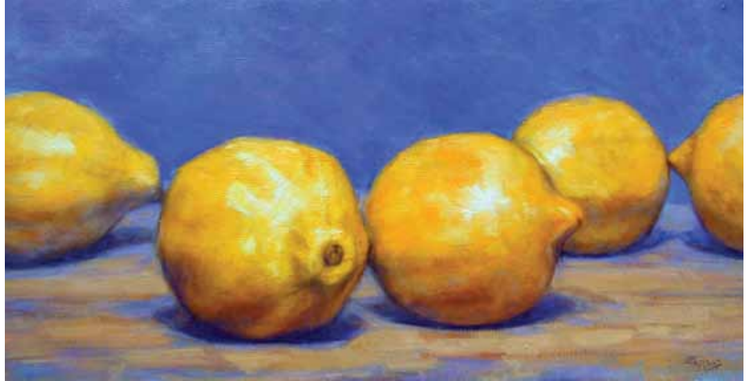
—“Five Lemons,” Peter Zambas

Starting with an introduction to materials and traditional oil painting techniques, we will practice painting from life and learn from master works. Move at your own pace as you learn Peter's approach to working with oils, including relationship drawing, color harmony and composition. Painting from still life, create compositions that capture the light, space and gesture of the subject. Bring your own painting materials or pay $15 supply fee directly to instructor.